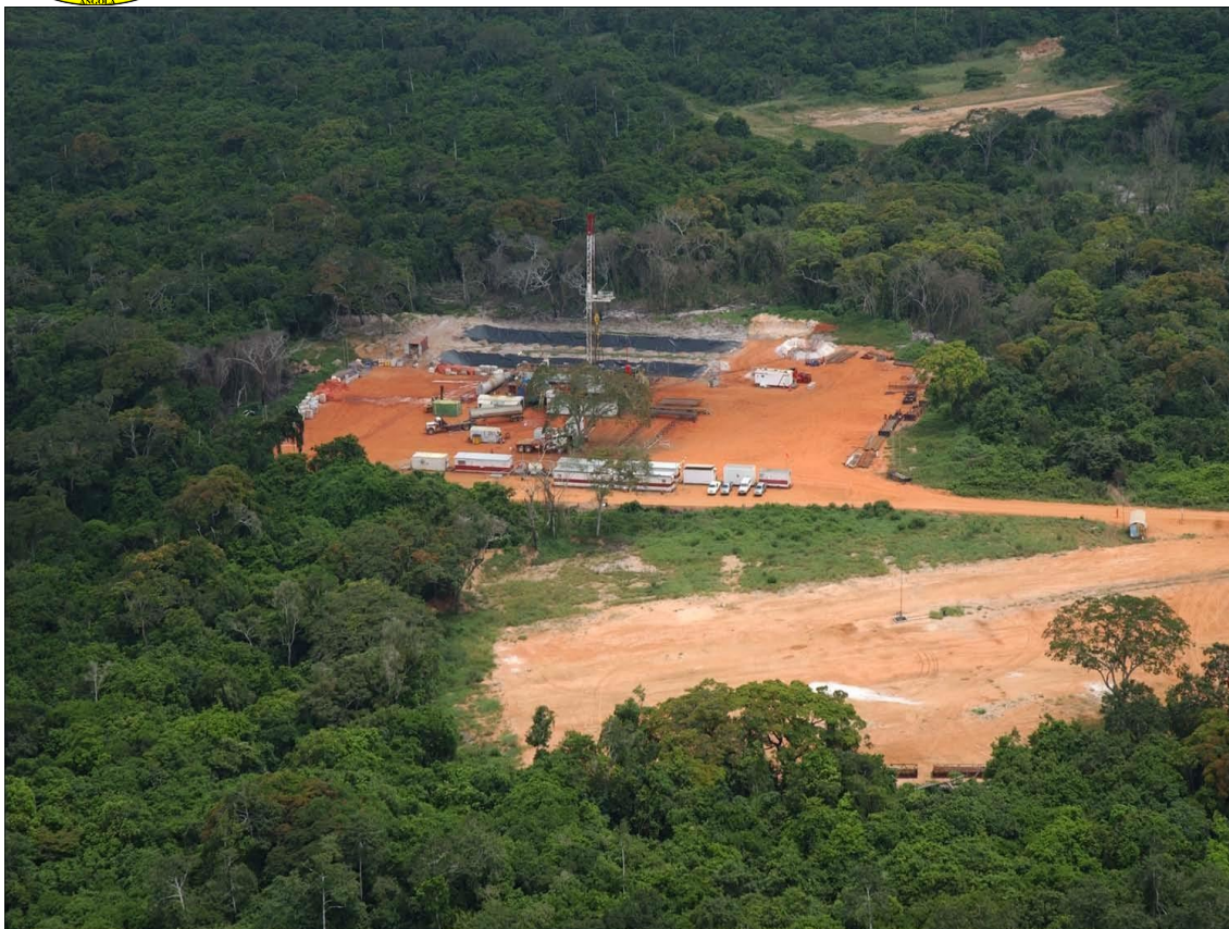
KB700 Operation for Total-Fina.