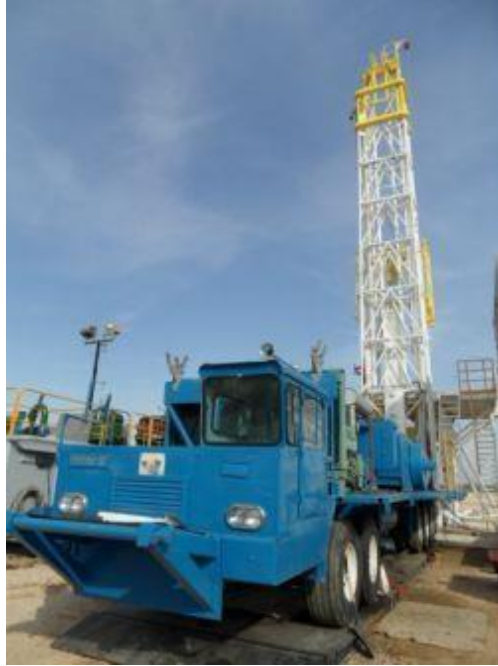
SA03 750 HP