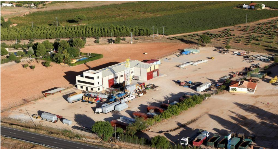
Sondagens Base in Spain