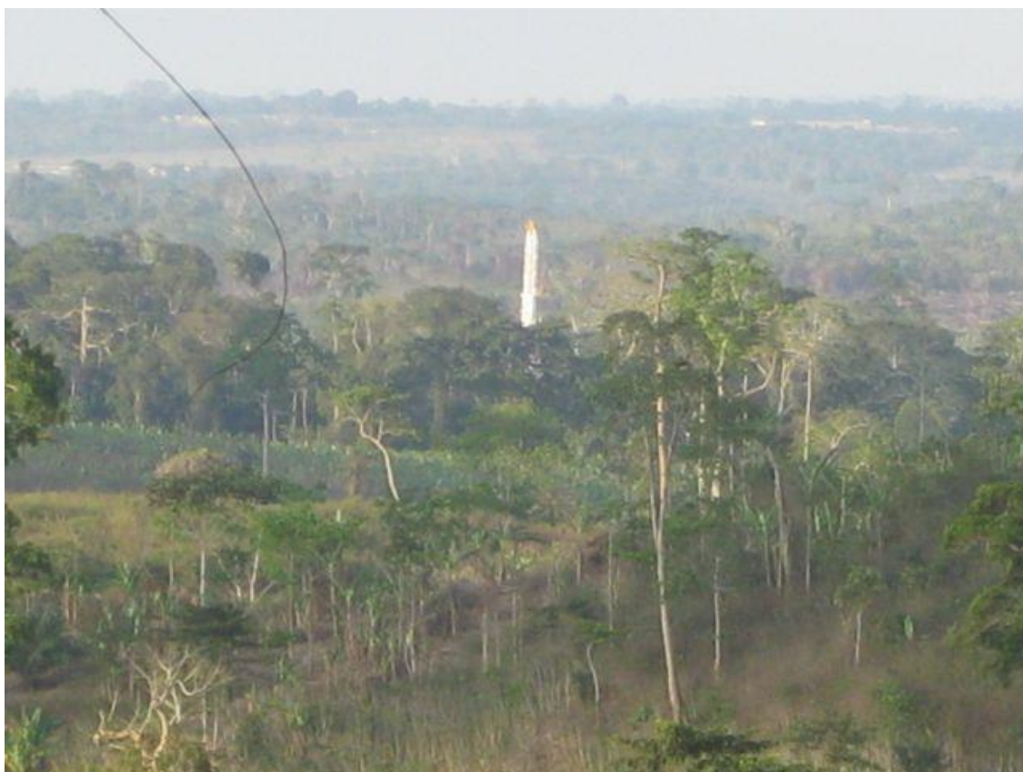
SA03 in the rainforest.