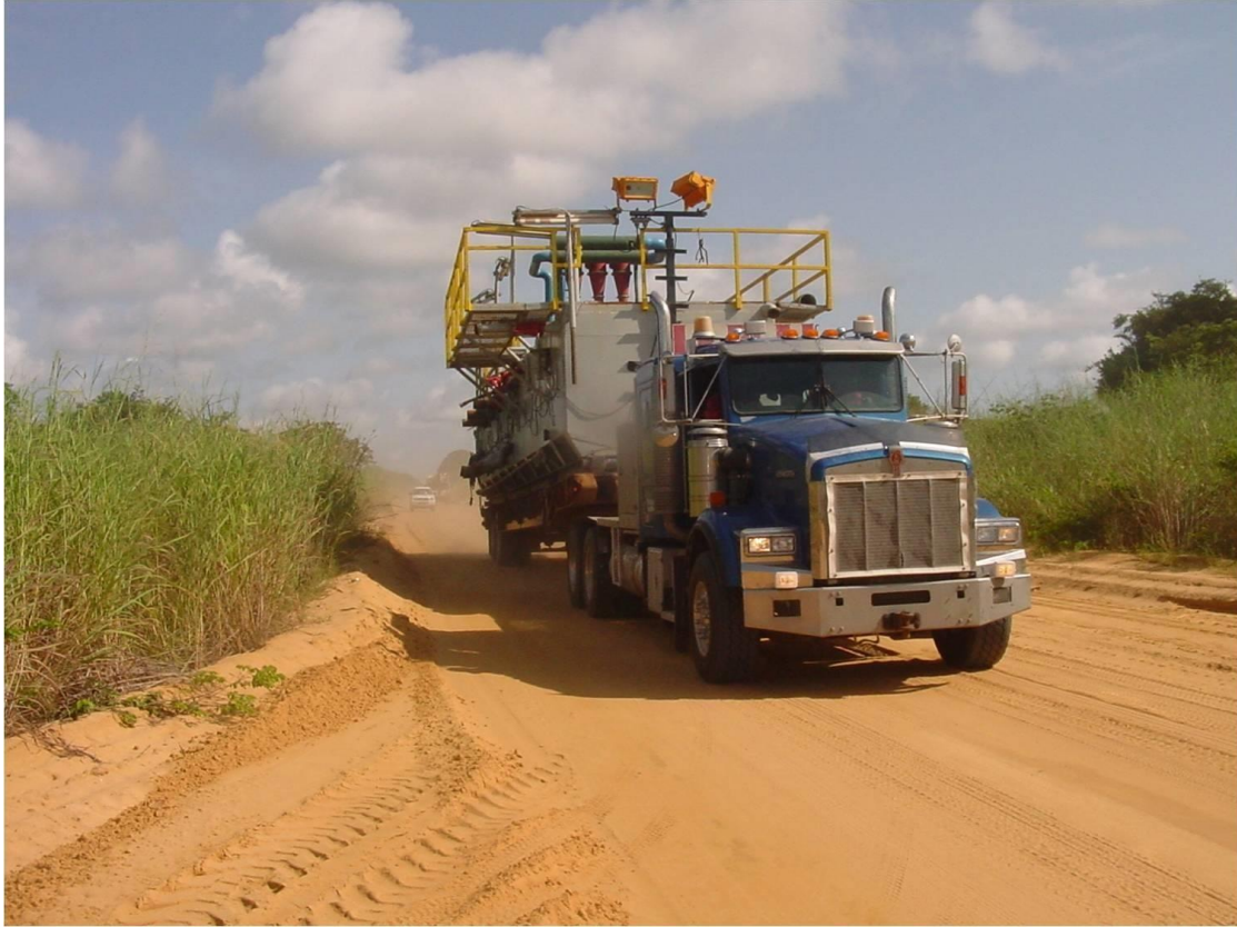
Soyo KB700 moving.