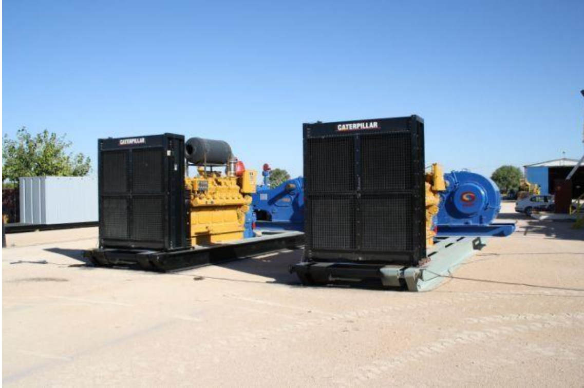
SA04 F1000 Mud pumps and CAT399 Engines.