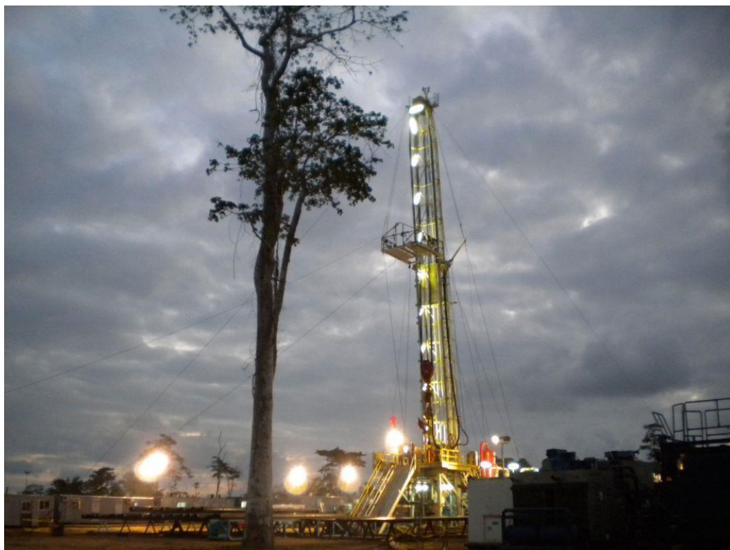
Castanha 3 (Cabinda).