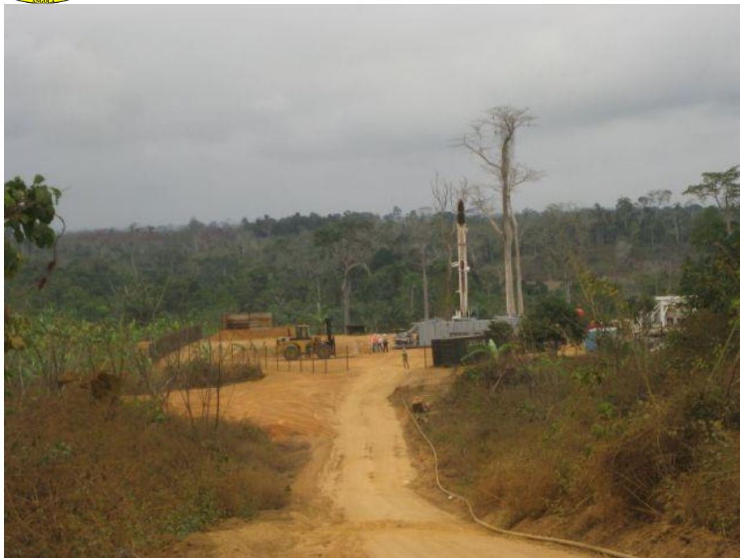
Preparing the location.