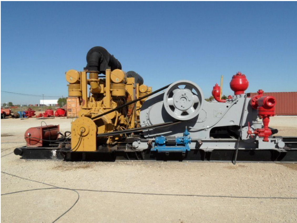
SA03 F800 Mud pumps and CAT3508 engines.