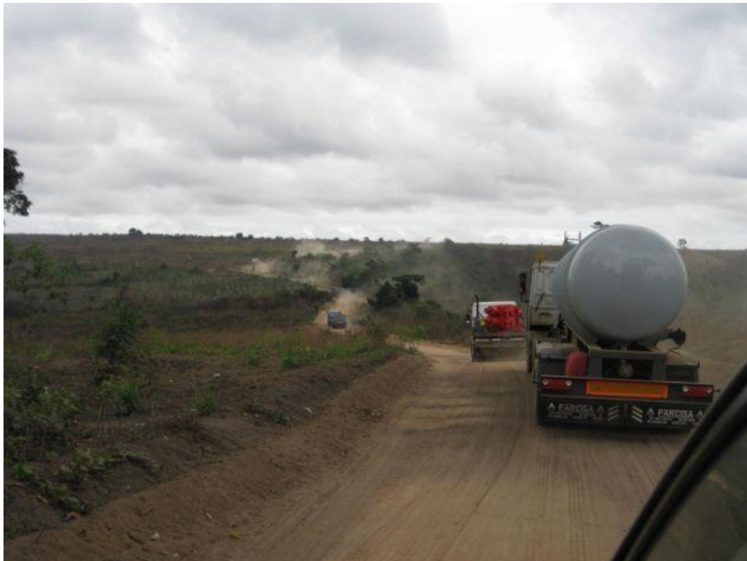
Rig move in Cabinda.