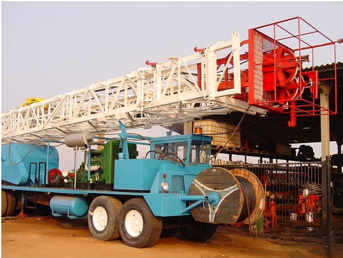
SA01 in Qinfuquena Base.