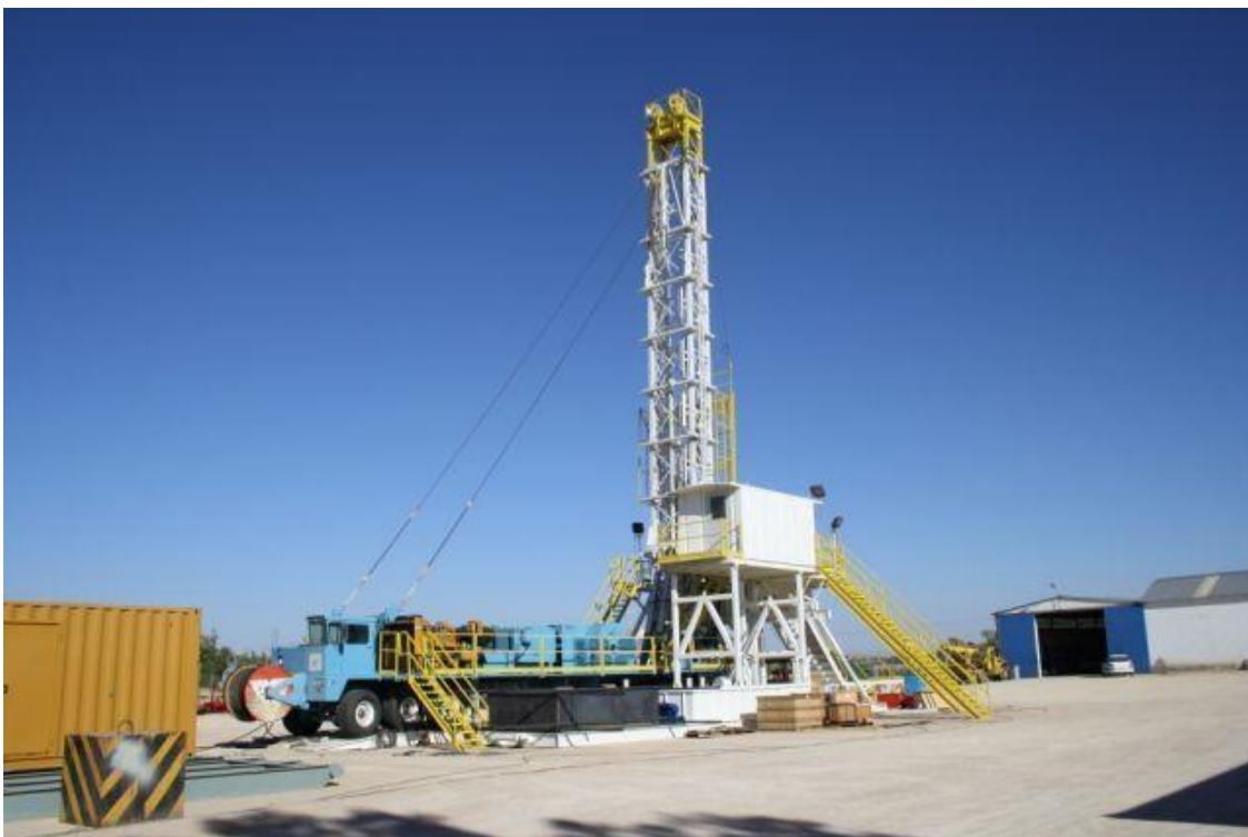
SA04 1000 HP Rigging up for test (Spain).