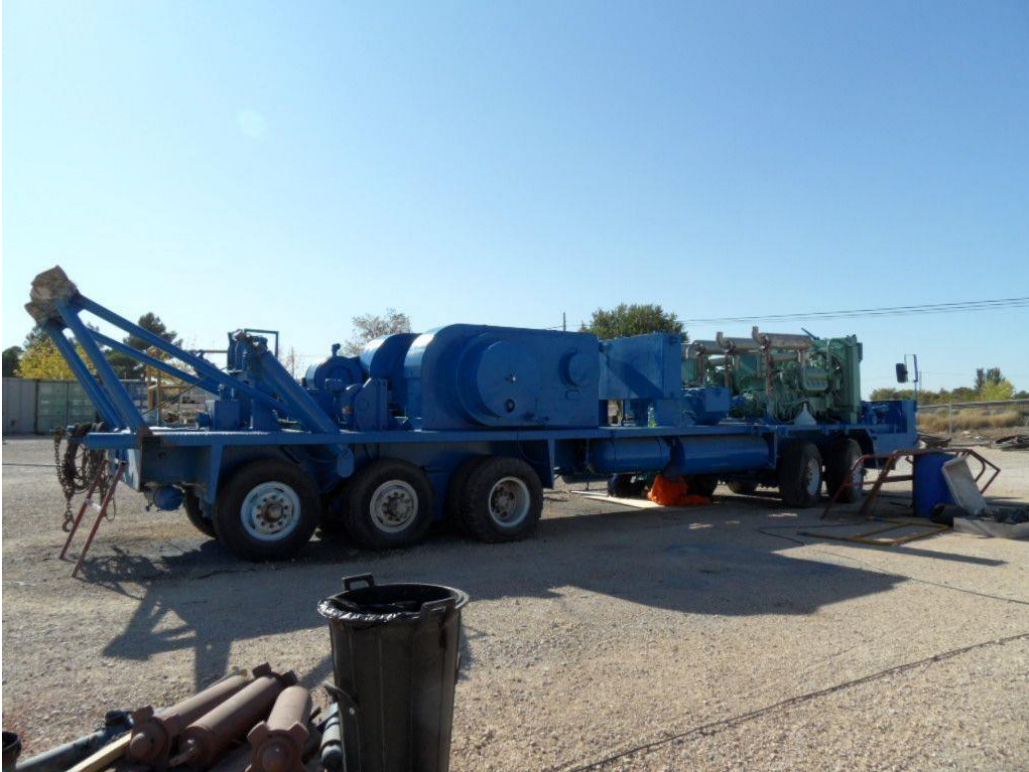
SA03 Overhaul(Spanish base).