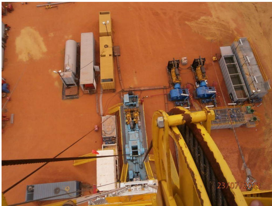
SA04 in Cabinda North