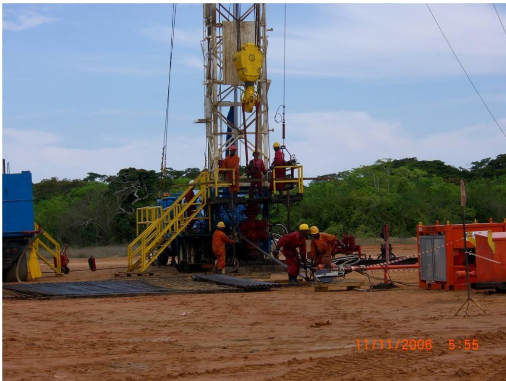
SA01 Workover for TOTAL-FINA.